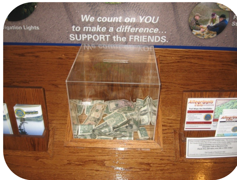
Raystown Visitor Center