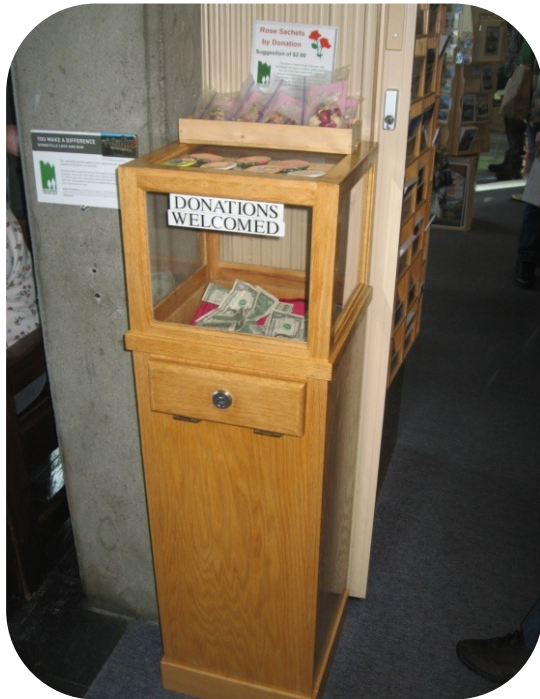
Bonneville Visitor Center