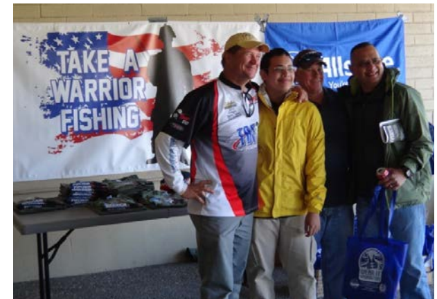
Multiple Lake sites are hosting events with support from the community, friends groups and corporations.