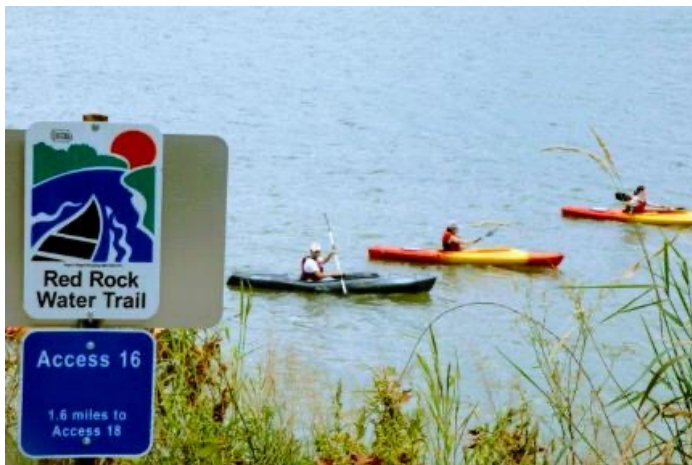
Lake Red Rock on the Des Moines River