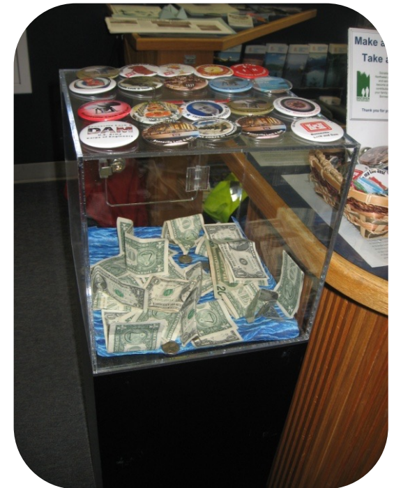
Bonneville Visitor Center