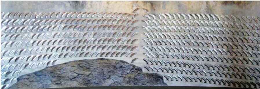
Donor board at the Tamástslikt Cultural Institute, Pendleton, Oregon

For contributions valued at $XX (TBD by manager) or above, a donor board or wall located and integrated into the project office, visitor center, or other appropriate visitor facility may be used to recognize the donation.