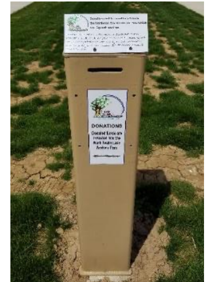
Mark Twain Lake FOREST Council Contribution boxes at recreation areas and VC