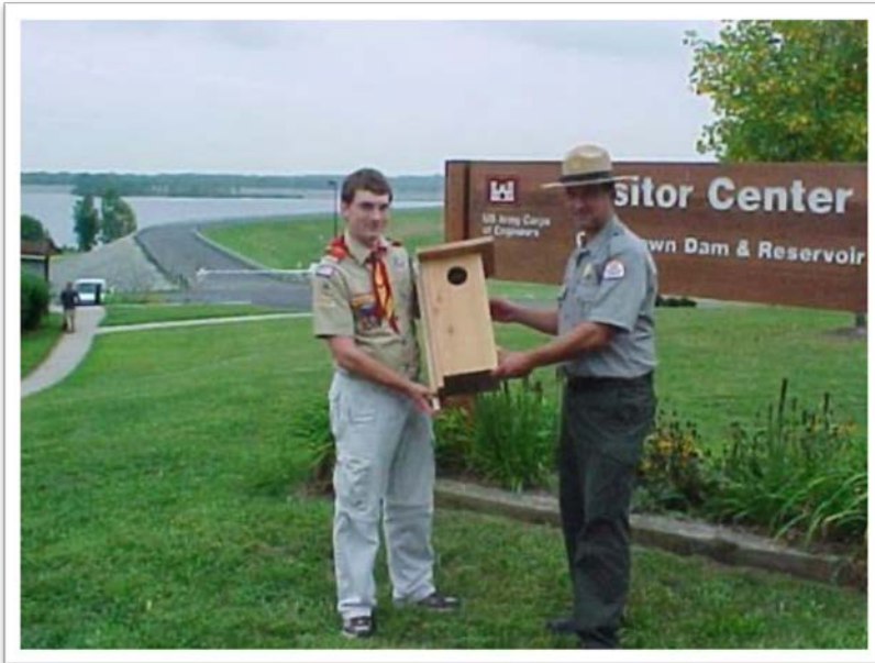
Donation of nesting boxes from an Eagle Scout

General: Contributions will be utilized to accomplish tasks or projects for the protection, improvement, restoration, rehabilitation or interpretation of natural resources, environmental features, recreation areas and facilities or cultural resources at the Project.